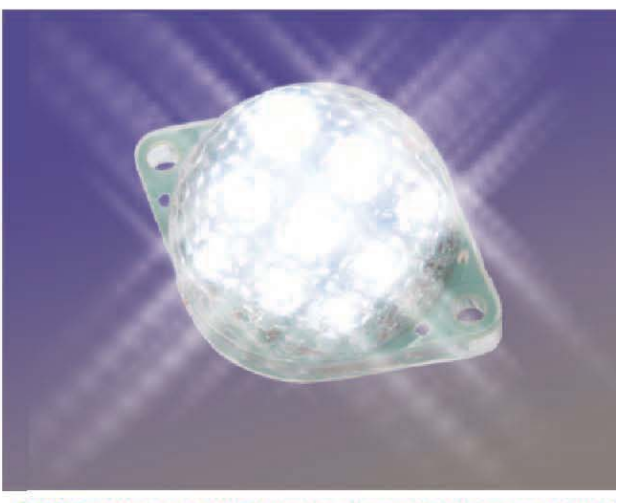
5.000 hours or max. 3 years assured luminous durati Made in Germa