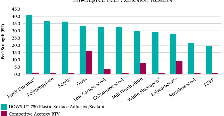
FIGURE 1: 180-Degree Peel Adhesion Comparison - DOWSIL™ 750 Plastic Surface Adhesive/Sealant

DOWSIL<sup>™</sup> 750 Plastic Surface Adhesive/ Sealant can be used in a wide range of temperatures and offers excellent UV resistance and durability; it does not become brittle or crack. The one-part RTV neutral-cure sealant has a working time of approximately 15 minutes. Once applied, its adhesion builds as full cure is achieved within days; it is not recommended to handle the assembled parts for 24 hours.